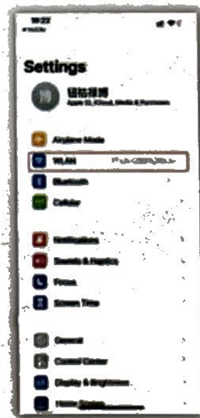
1 Click to open the system WiFi interface

1. Connect the machine's own hot spot, the hot spot at the beginning of PTZ. Click Connect. After the link is successful, return to APP, as shown in the following figure.