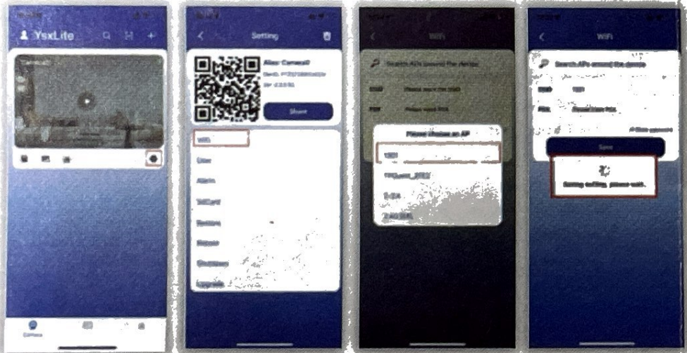
1. Click on the pin in the figure 2. Click WiFi Settings 3. Find WiFi and enter the password link 4. Click OK to restart

2. Find your own WIFI account and enter the password correctly, then click OK to return.